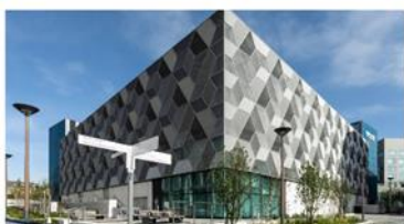
The Frederick Douglass Centre

The Frederick Douglass Centre, 2, The Helix, Newcastle upon Tyne NE4 5TG